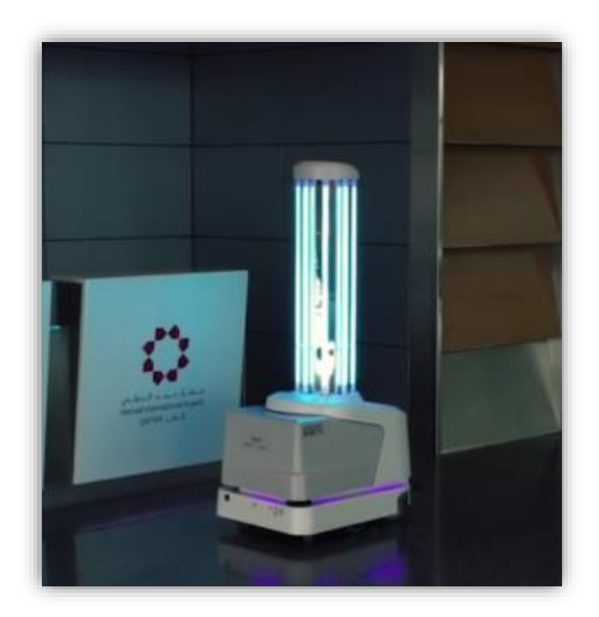
Fully autonomous mobile disinfection robot