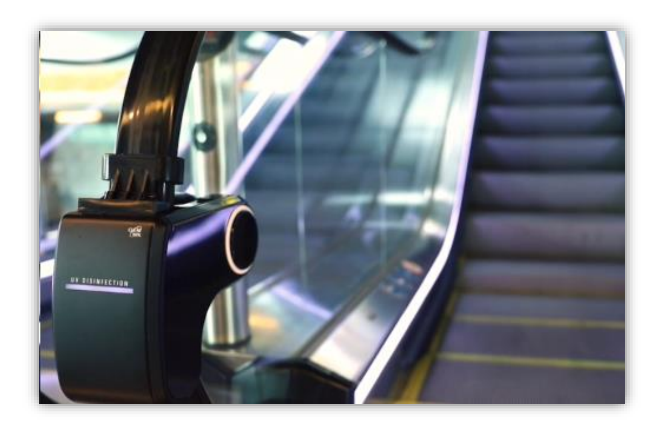
New automatic UV disinfection systems are implemented across the terminal