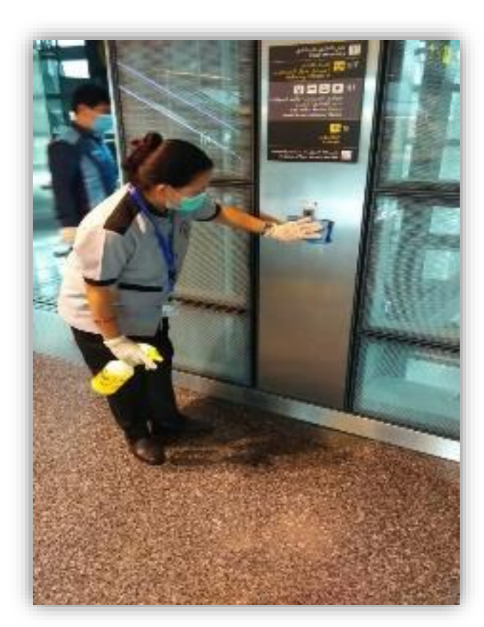
All passenger touch points are disinfected regularly.