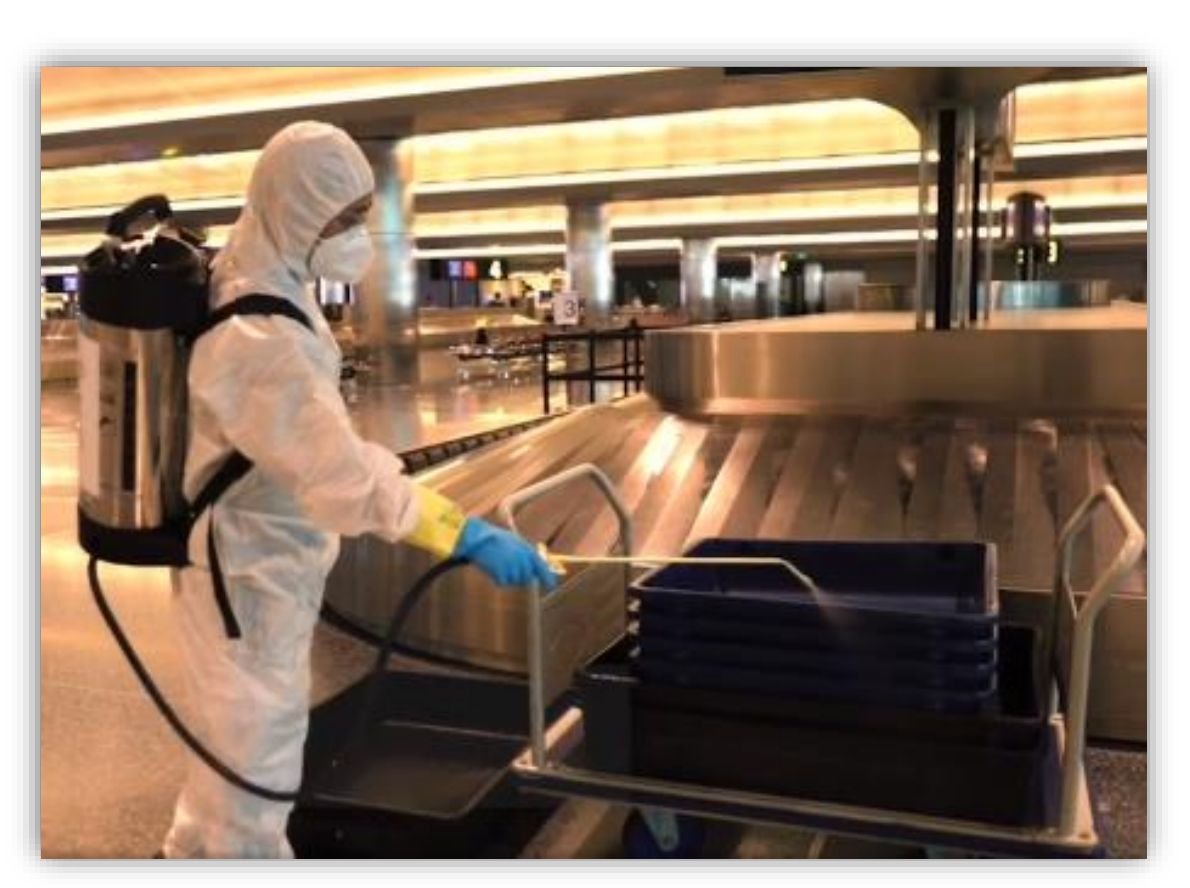
Disinfection of baggage belts and trays.