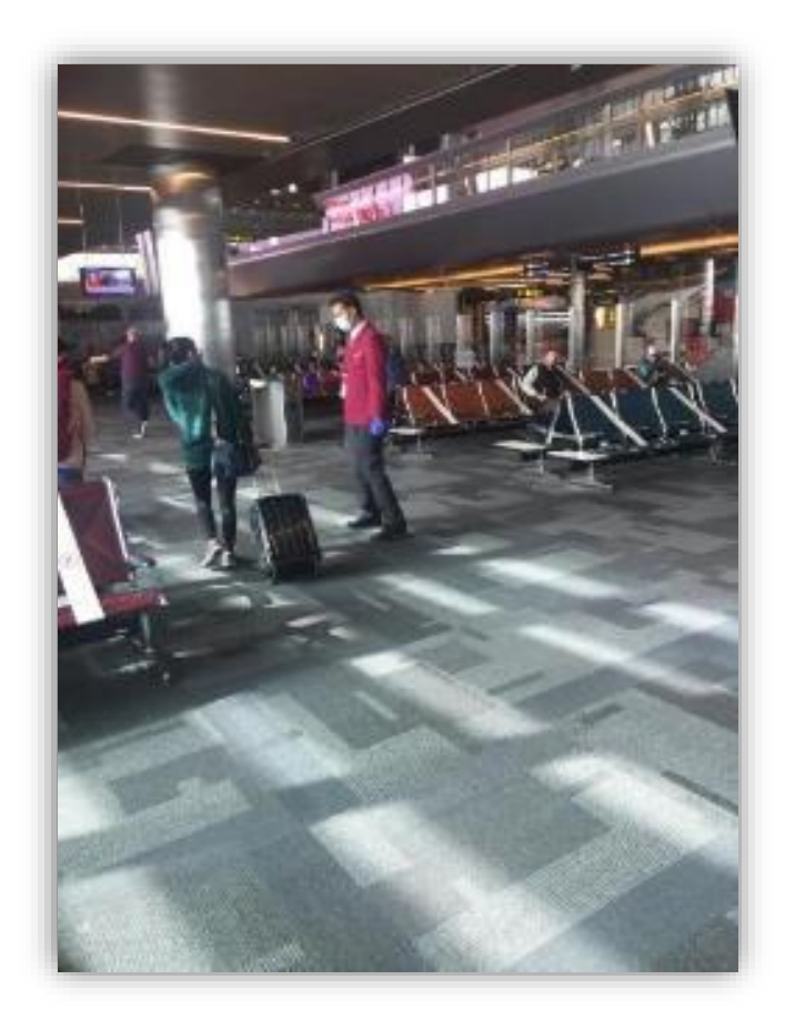
Airport personnel monitors physical distancing measures are followed.